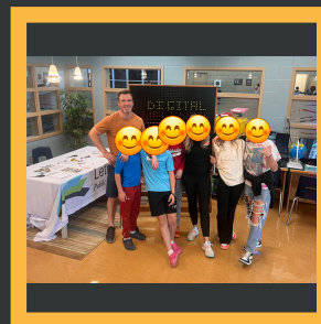
D.W. Team Luncheons