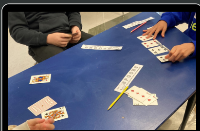
Community and Brain Developing Games